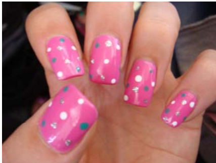
Avoid extreme nail styles or colors.