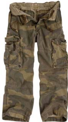
Cargo pants, baggy pants and jeans are not acceptable (except for Casual Fridays).