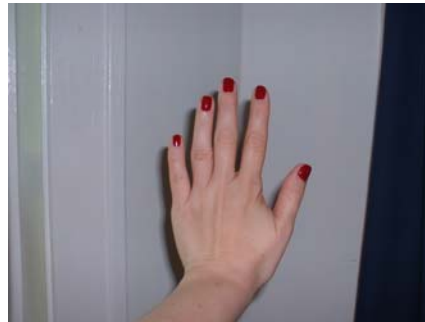
Nails should be clean and well groomed.