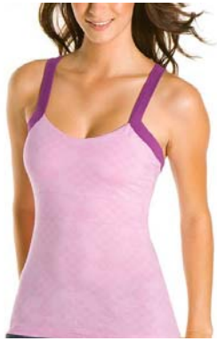
No spaghetti straps, tank tops, cleavage or midriff showing tops.