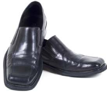
Professional-looking leather shoes should be worn.