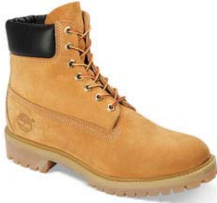
Construction, industrial, tennis shoes, cowboy or military boots are not acceptable (except for Casual Fridays).