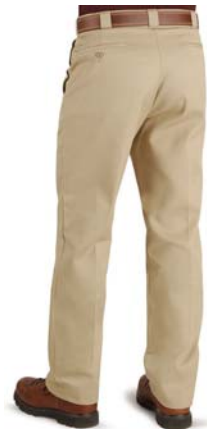
Wear khakis, chinos or corduroys. If you wear a belt, it should match the color of your shoes.