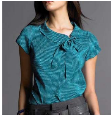
Tailored shirts, blouses, knit sweaters and sweater sets are appropriate. Cotton, silk, and blends are appropriate.