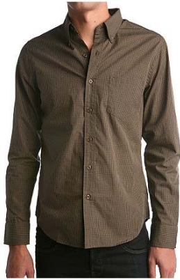
Loose-fitting shirts or t-shirts that are not tucked in are not appropriate (except for Casual Fridays).