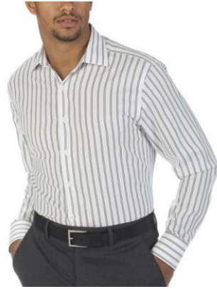
Tucked in long-sleeved shirts or polo shirts that are white or light blue, solid, or conservative stripes are appropriate.