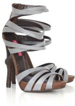
Sandals should not be extremely dressy or extremely casual.