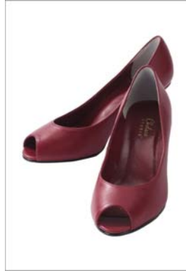
Shoes should be professional-looking. Leather or fabric in colors such as black, navy, dark red and brown are acceptable.